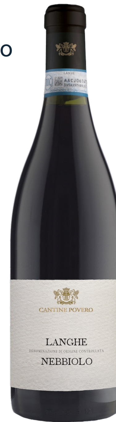
Cantine Povero Langhe Nebbiolo