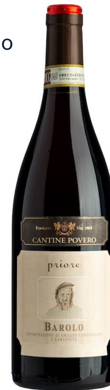
Cantine Povero Priore Barolo

Press: 95 DE (2017), 92 DE (2016), 90 RP (2016)