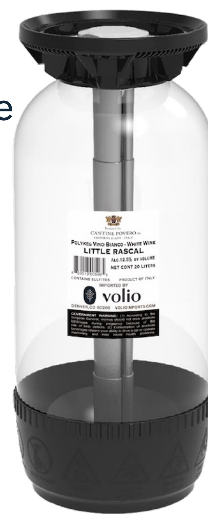
Cantine Povero Little Rascal Arneis 20L Polykeg