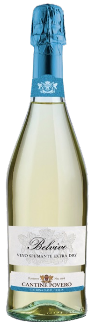
Cantine Povero Belvive