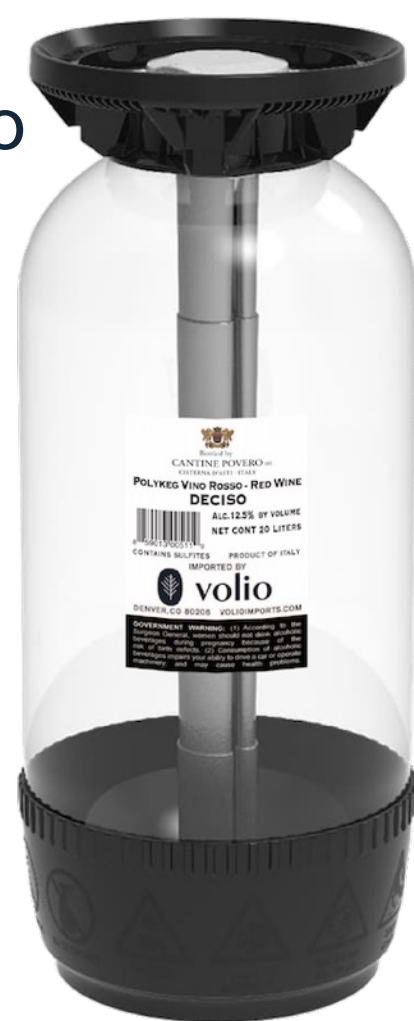
Cantine Povero Deciso Dolcetto 20L Polykeg