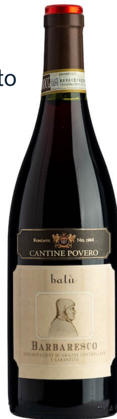
Cantine Povero Batu Barbaresco