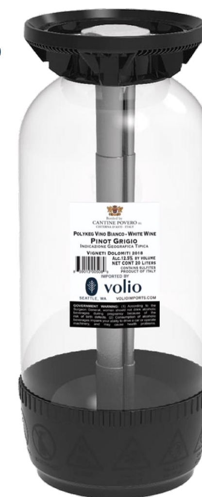
Cantine Povero Vino Bianco Pinot Grigio 20L Polykeg