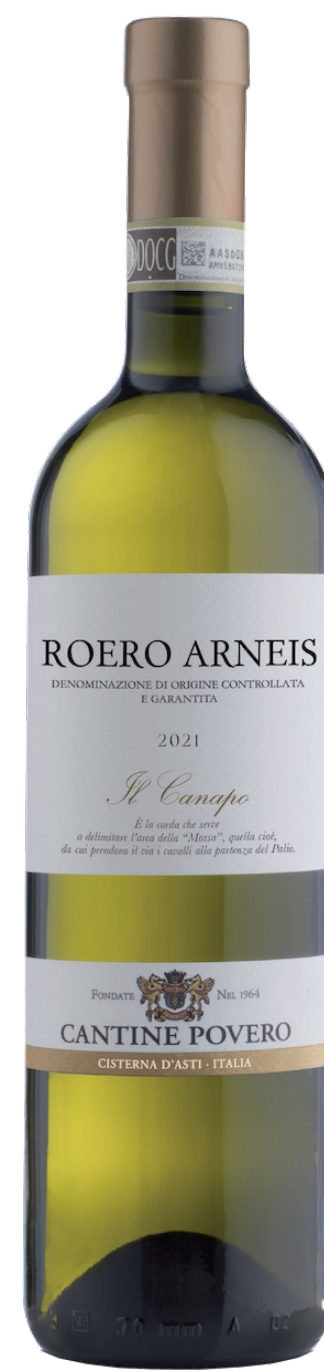
Cantine Povero Roero Arneis