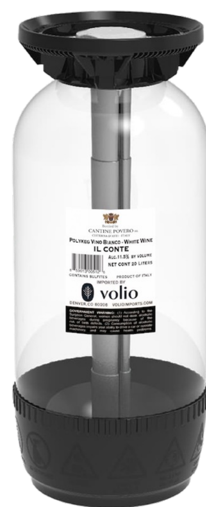
Cantine Povero Il Conte Cortese 20L Polykeg