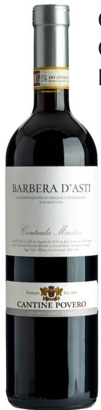
Cantine Povero Contrada Maestra Barbera d'Asti