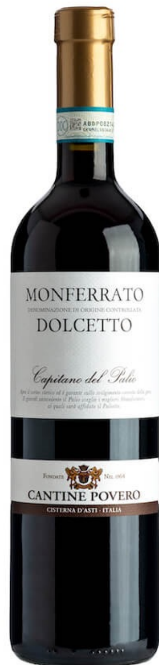
Cantine Povero Capitano del Palio Monferrato Dolcetto