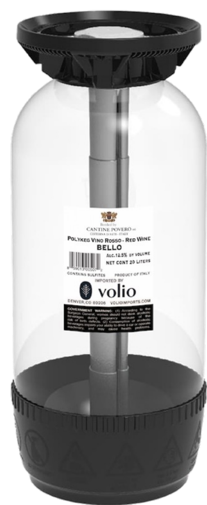
Cantine Povero Bello Barbera 20L Polykeg